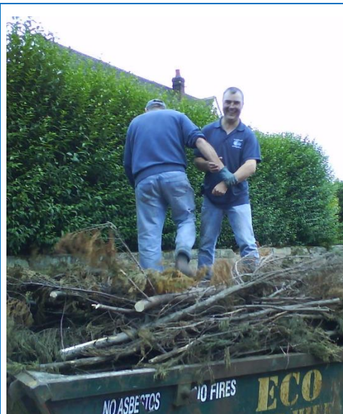
Church Work Party July 2019