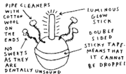
THE SAFETY CHRISTINGLE