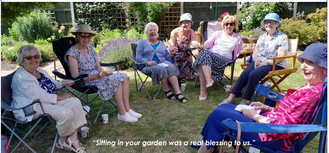
"Sitting in your garden was a real blessing to us."

"We had a pleasant afternoon, sharing food with friends and sisters in faith."