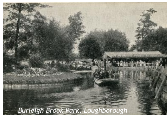
Burleigh Brook Park, Loughborough

Saturday 16 th July 3pm Visiting Bell ringers from St Ann's Church, Bewdley