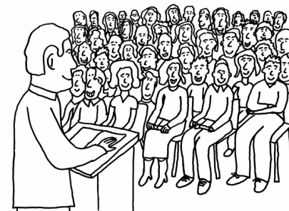
CHURCH MEETINGS ARE BRILLIANT

All those whose names are on the church electoral roll will have the opportunity to elect churchwardens and members of the PCC and to approve the appointment of sidespersons. You will also learn more about what has been happening in all aspects of the church over the past year and have a chance to ask questions.