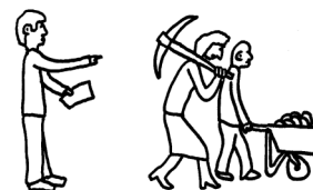
ORGANISING A WORK PARTY