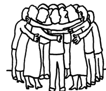
THE COMMENCEMENT OF A GROUP HUG