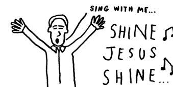
SOME ODD OR UNPREDICTABLE BEHAVIOUR