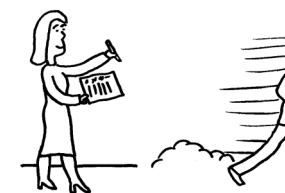
APPROACHING PEOPLE WITH A ROTA