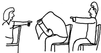
WHEN NO-ONE WILL ADMIT TO BEING THE PERSON DOWN TO LEAD THE INTERCESSIONS