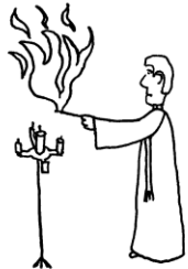
WHEN AN EASTER FIRE OR ADVENT CANDLE REFUSES TO LIGHT