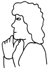
AT MOMENTS WHEN PONDERING IS EXPECTED

THIS IS ONE OF THE CENTRAL ELEMENTS OF A CHURCH SERVICE. WE OBSERVE A LITURGICAL PAUSE AT THE FOLLOWING POINTS: