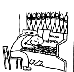
WHEN THE ORGANIST HASN'T COME IN