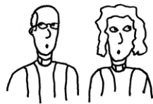
WHEN NOBODY HAS A CLUE WHAT IS SUPPOSED TO HAPPEN NEXT